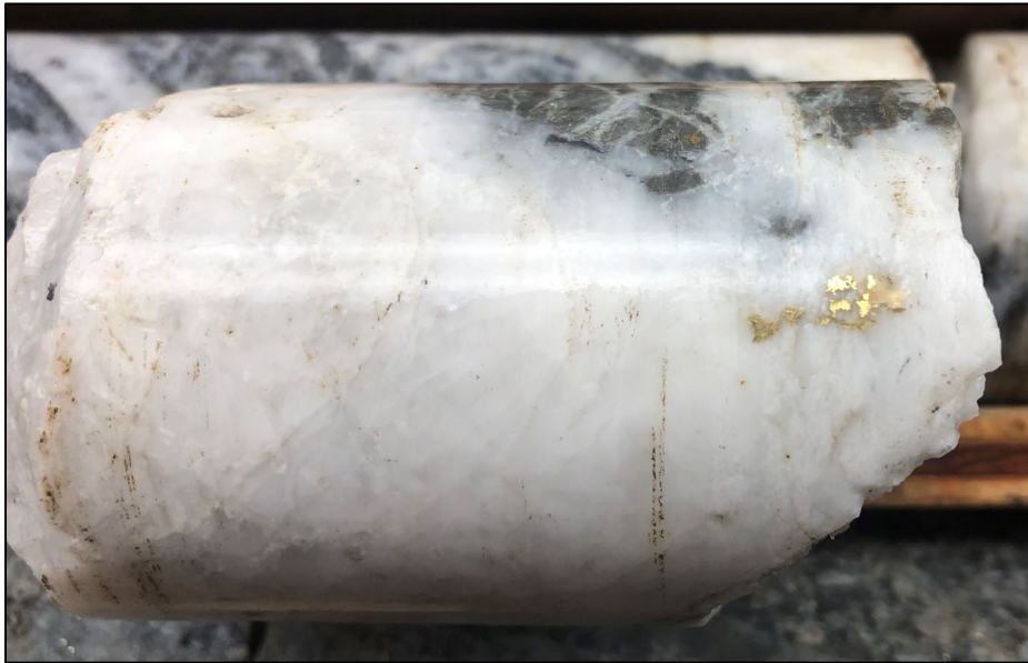
FIGURE 3 – Visible Gold in Drill Intercept I-19-13 (in retained half core) (Assayed 0.36 oz per ton / 2.8 feet)